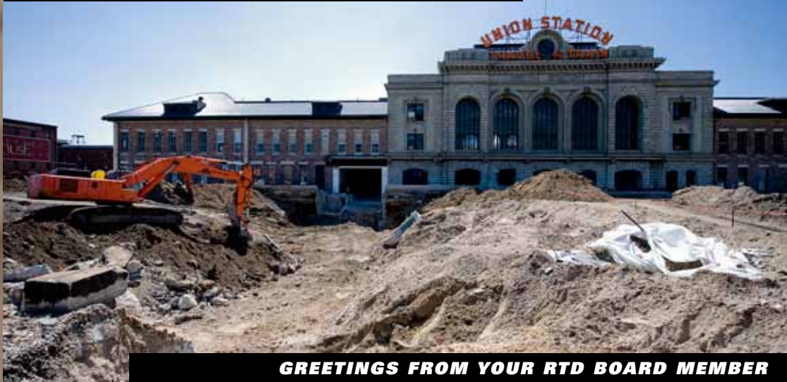
Demolition of the pedestrian tunnel at Denver Union Station started in early 2011 as part of the redevelopment of the historic site.