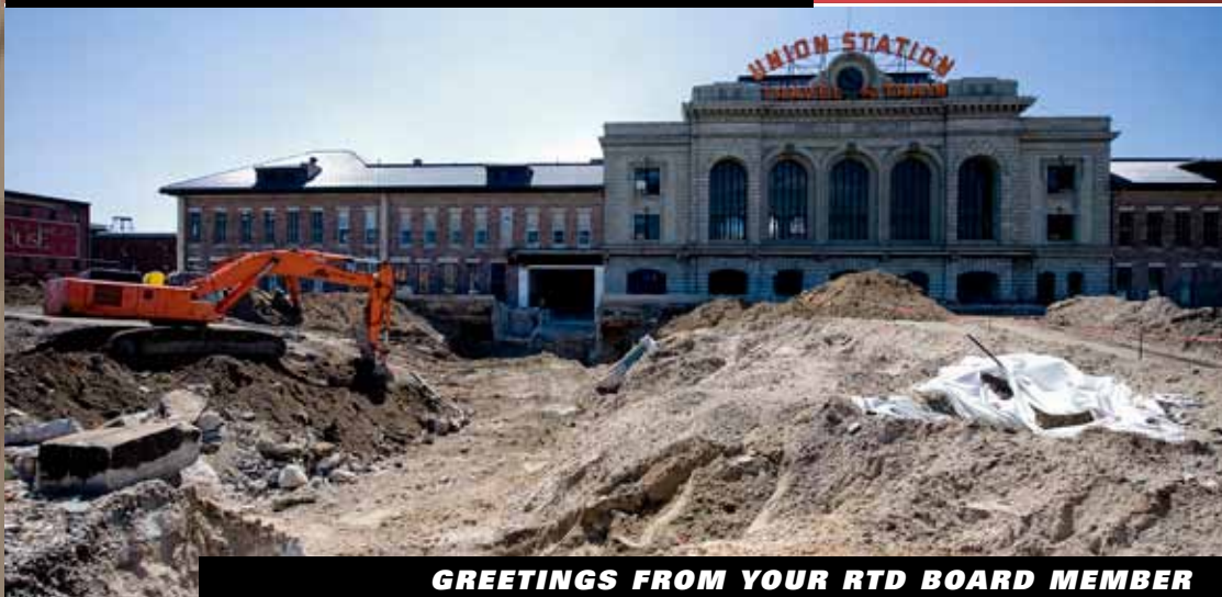
Demolition of the pedestrian tunnel at Denver Union Station started in early 2011 as part of the redevelopment of the historic site.