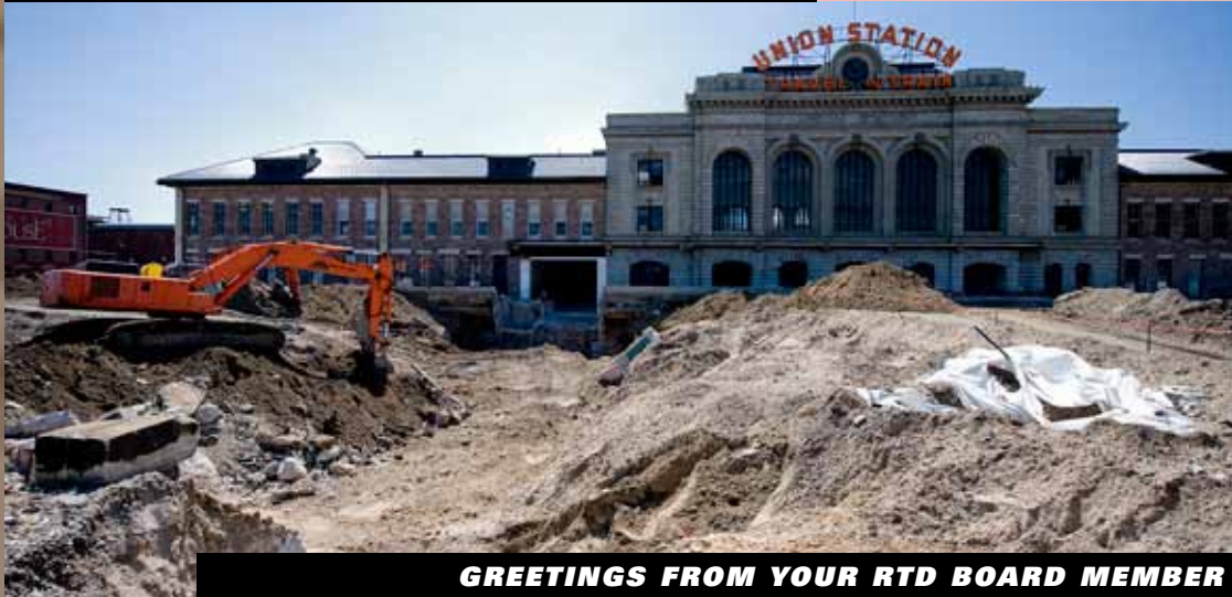
Demolition of the pedestrian tunnel at Denver Union Station started in early 2011 as part of the redevelopment of the historic site.