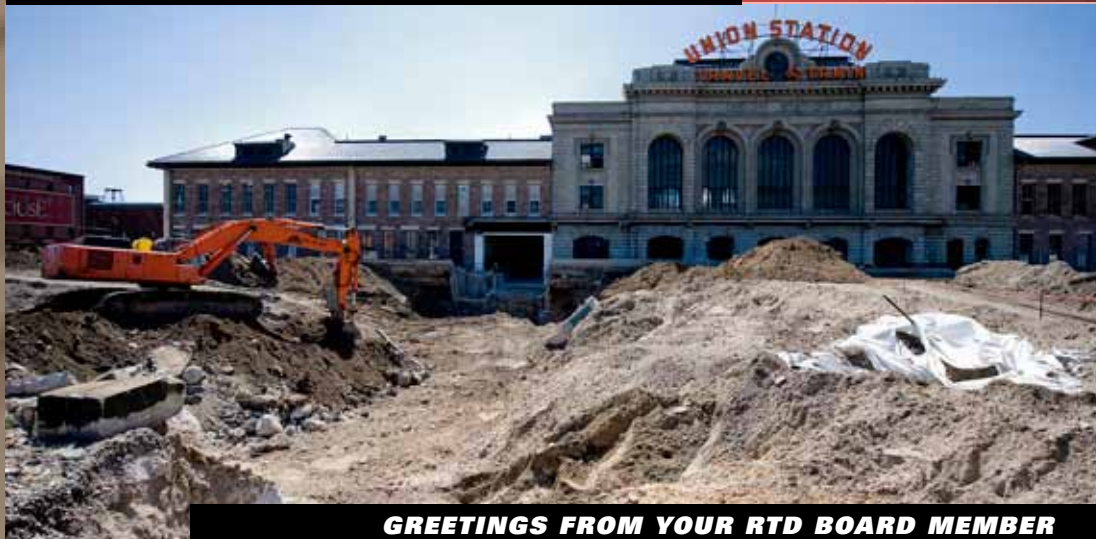
Demolition of the pedestrian tunnel at Denver Union Station started in early 2011 as part of the redevelopment of the historic site.