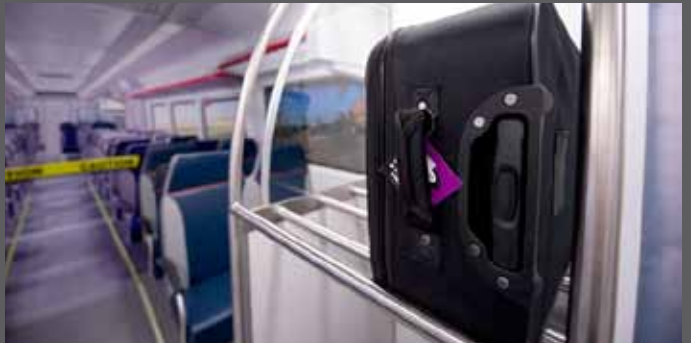
The cars will be equipped with luggage racks for those who are taking the train to and from Denver International Airport.