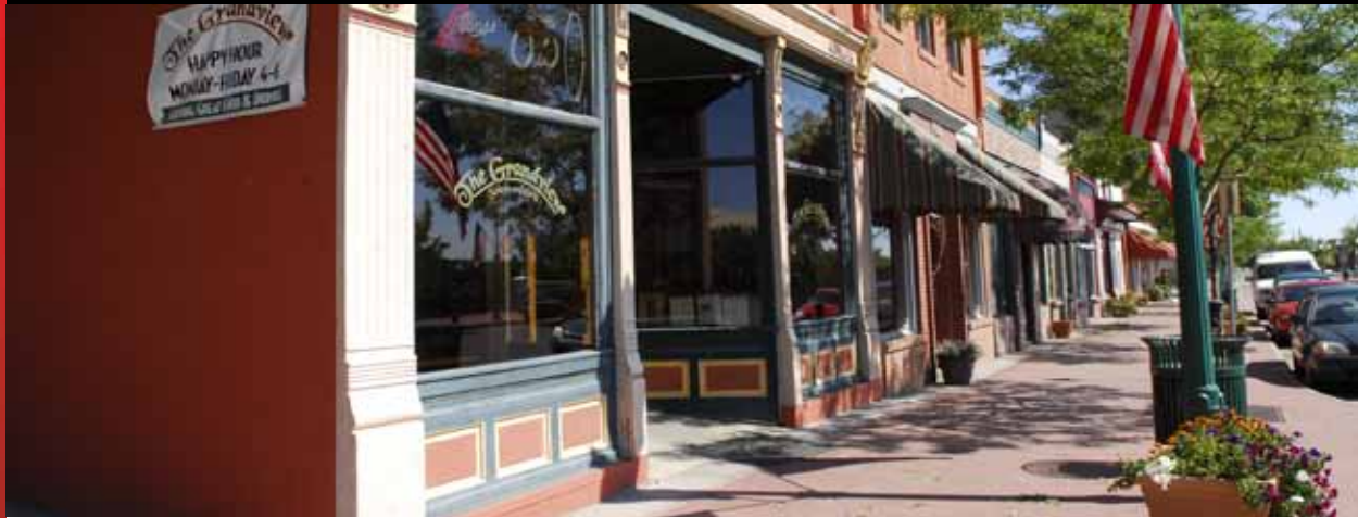
Businesses near the future site of the Olde Town Arvada station, one of the stations on the upcoming FasTracks Gold Line.

RTD FasTracks is one step closer to the completion of a world-class transit system for the Denver metro region. On May 2, the Federal Transit Administration (FTA) sent RTD's $1.03 billion FasTracks Full Funding Grant Agreement (FFGA) request to Congress for the required 60-day review period. The grant will help fund the East Rail Line to Denver International Airport and the Gold Line to Arvada and Wheat Ridge.