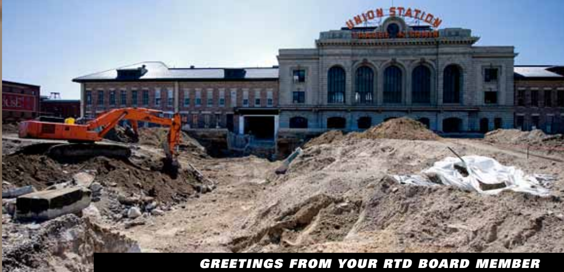
Demolition of the pedestrian tunnel at Denver Union Station started in early 2011 as part of the redevelopment of the historic site.