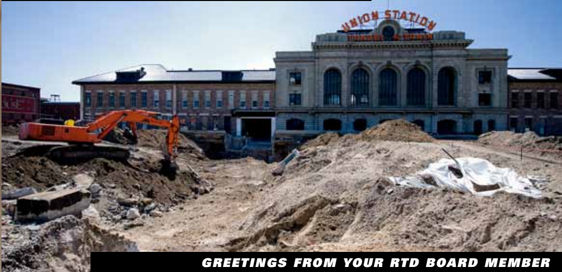
Demolition of the pedestrian tunnel at Denver Union Station started in early 2011 as part of the redevelopment of the historic site.