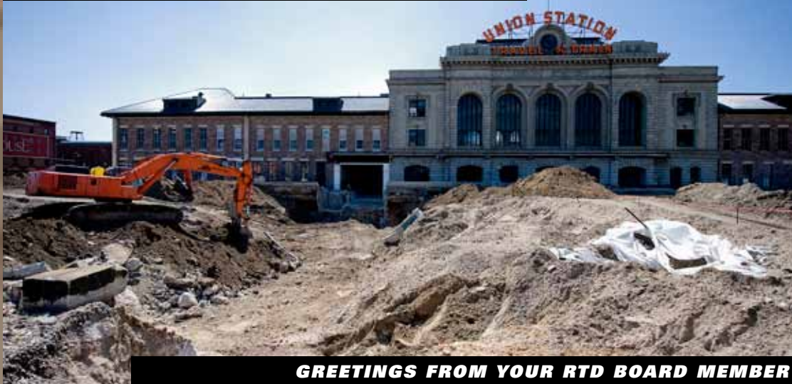
Demolition of the pedestrian tunnel at Denver Union Station started in early 2011 as part of the redevelopment of the historic site.