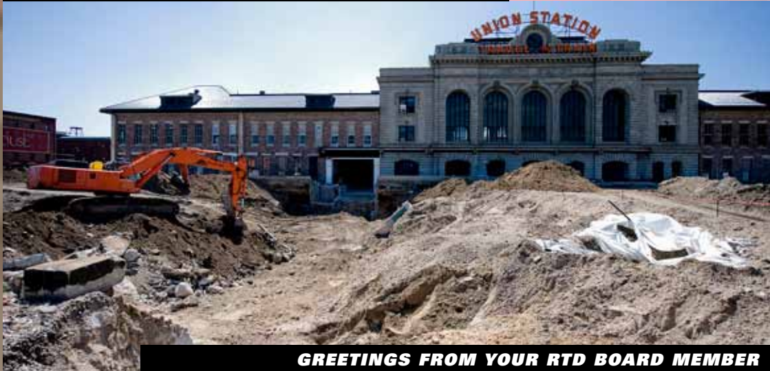
Demolition of the pedestrian tunnel at Denver Union Station started in early 2011 as part of the redevelopment of the historic site.