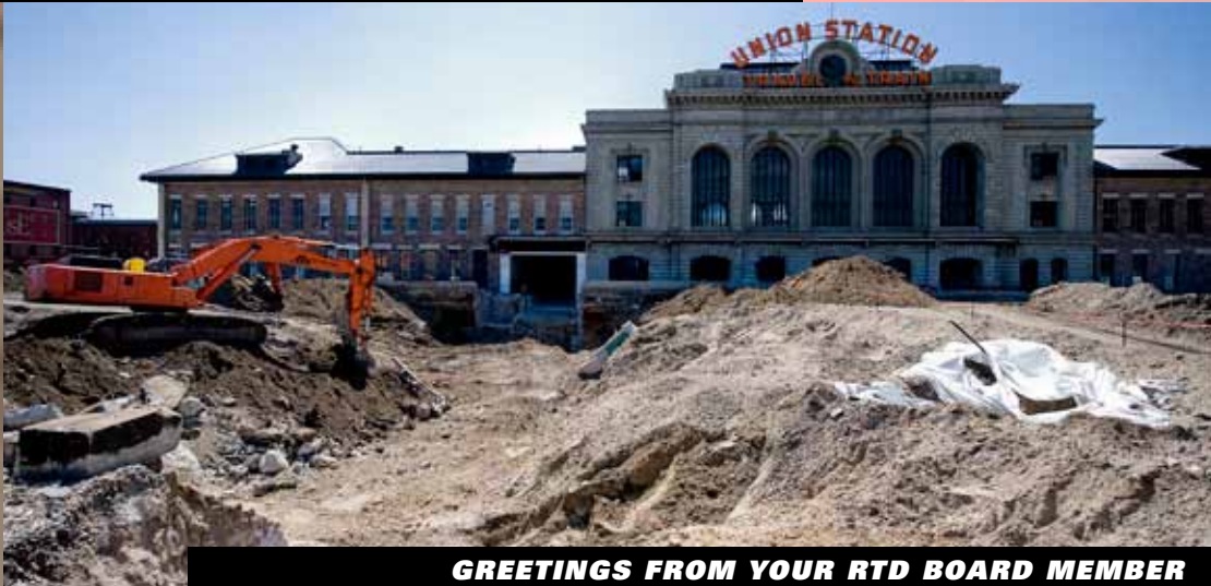
Demolition of the pedestrian tunnel at Denver Union Station started in early 2011 as part of the redevelopment of the historic site.