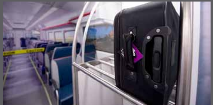
The cars will be equipped with luggage racks for those who are taking the train to and from Denver International Airport.