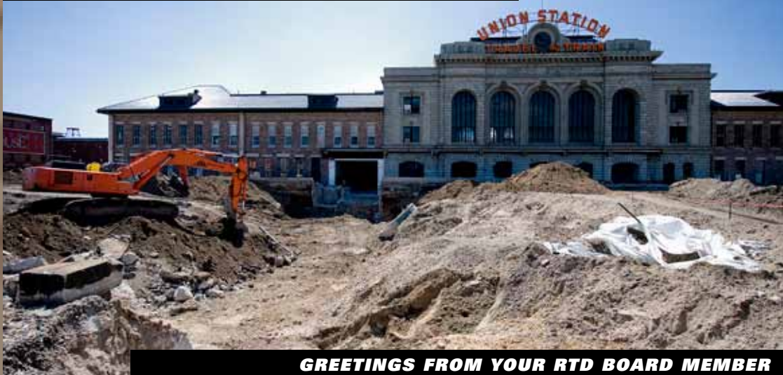
Demolition of the pedestrian tunnel at Denver Union Station started in early 2011 as part of the redevelopment of the historic site.