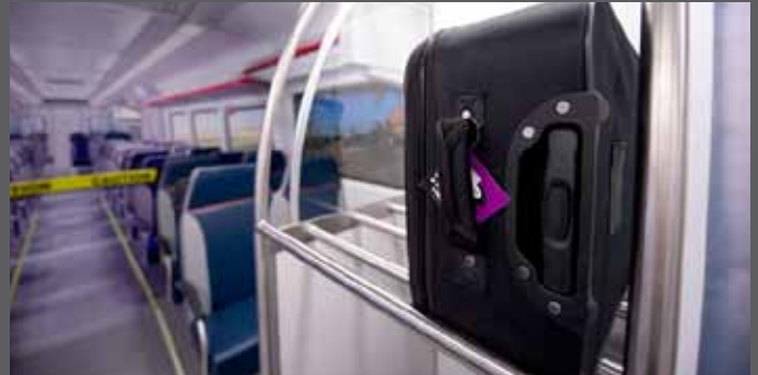
The cars will be equipped with luggage racks for those who are taking the train to and from Denver International Airport.