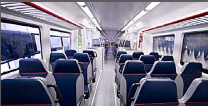
Each train car will fit 232 people – 90 seated and 142 standing.