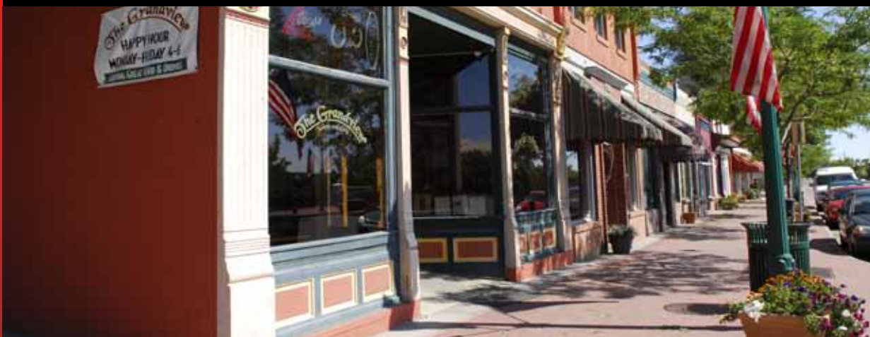
Businesses near the future site of the Olde Town Arvada station, one of the stations on the upcoming FasTracks Gold Line.

RTD FasTracks is one step closer to the completion of a world-class transit system for the Denver metro region. On May 2, the Federal Transit Administration (FTA) sent RTD's $1.03 billion FasTracks Full Funding Grant Agreement (FFGA) request to Congress for the required 60-day review period. The grant will help fund the East Rail Line to Denver International Airport and the Gold Line to Arvada and Wheat Ridge.