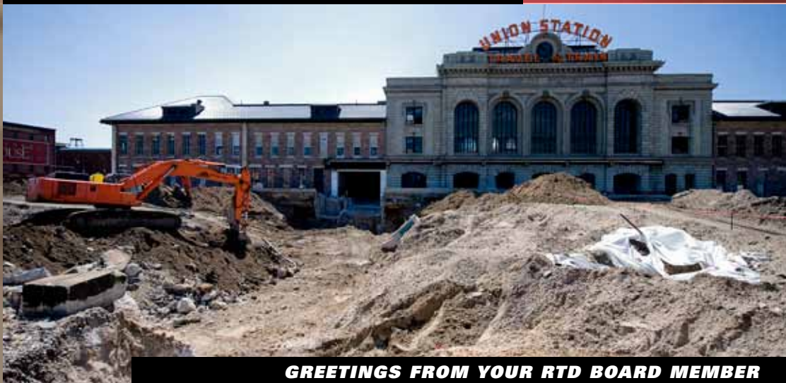
Demolition of the pedestrian tunnel at Denver Union Station started in early 2011 as part of the redevelopment of the historic site.