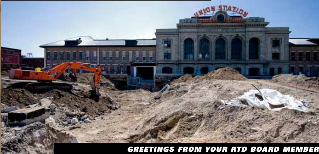
Demolition of the pedestrian tunnel at Denver Union Station started in early 2011 as part of the redevelopment of the historic site.