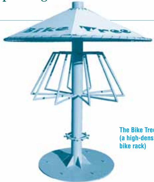
The Bike Tree (a high-density bike rack)

These upgrades are currently being implemented at these locations: Alameda Station, Belleview Station, Boulder Transit Center, Broadway and 27th Way park-n-Ride, Colorado Station, Denver Union Station, Dry Creek Station, Englewood Station, Evans Station, Littleton/Downtown Station, Littleton/Mineral Station, Market Street Station, Nine Mile Station, Orchard Station, Table Mesa park-n-Ride, Wagon Road park-n-Ride and Yale Station. These sites are considered top priority due to the high demand over the past two years. The completion of these enhancements is scheduled for spring 2010.