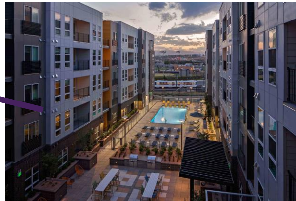
Colfax at Auraria Station 253 student housing units built in 2019

From 2000 to 2019, about 34,300 multi-family residential units and 7 million square feet of office space have been built within a half-mile of rail and bus rapid transit (BRT) stations. 2019 had the most TOD retail deliveries since 2009 and the most TOD residential units ever delivered.