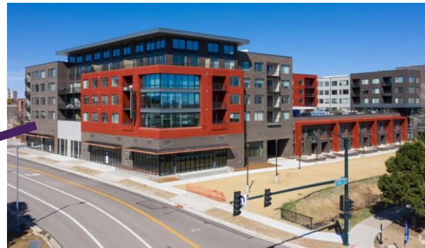
US 36 & Sheridan Station 373 residential units built in 2019, the first TOD at this station