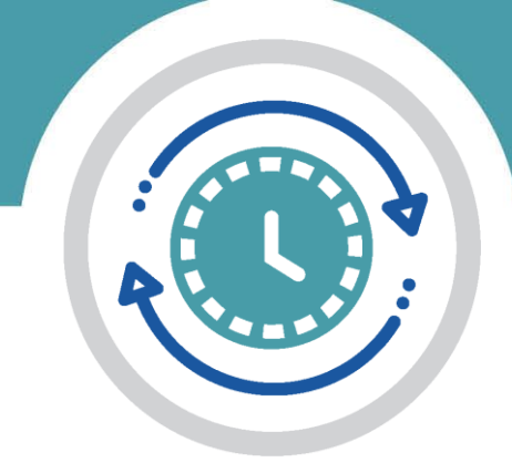
2019 Transit vs Auto Travel Time Comparison from End-of-Line Stations to Downtown Denver during AM Peak