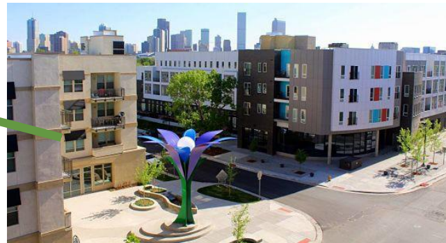
10 th & Osage Station Highest share of affordable units (75%)