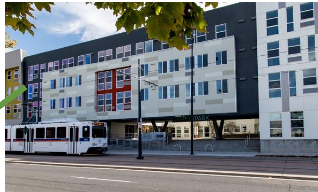
25 th & Welton Station Highest number of affordable units (687) 41% of all residential units